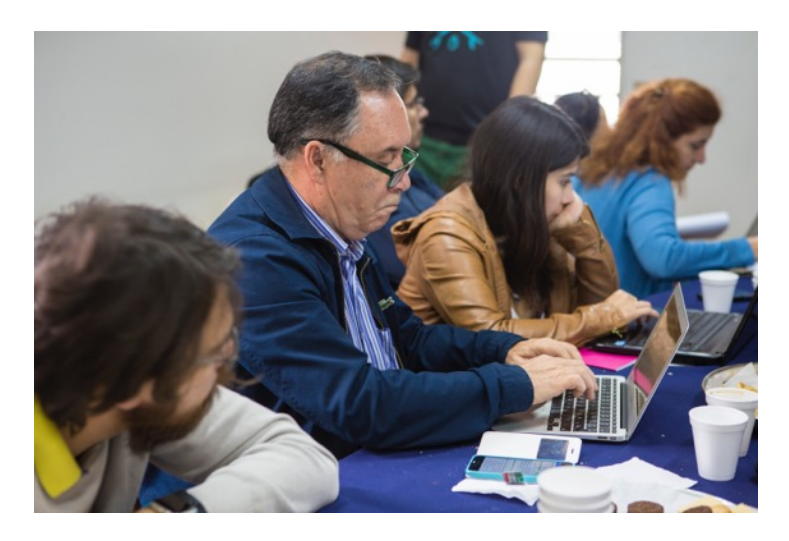
Working session from the Chile Workshop

After we all spent weeks creating the drafts of the learning scenarios, it was time to discuss and refine them during our first international workshop in Chile, where we met from 14<sup>th</sup> to 18<sup>th</sup> March 2016. Several new concepts and countless ideas shared during many hours of work lead to the development of an intermediate form of the scenarios. Working together on creating innovative non-formal learning tools might not sound as an extremely difficult task, but it sure is very challenging, especially when our original ideas don't really coincide.