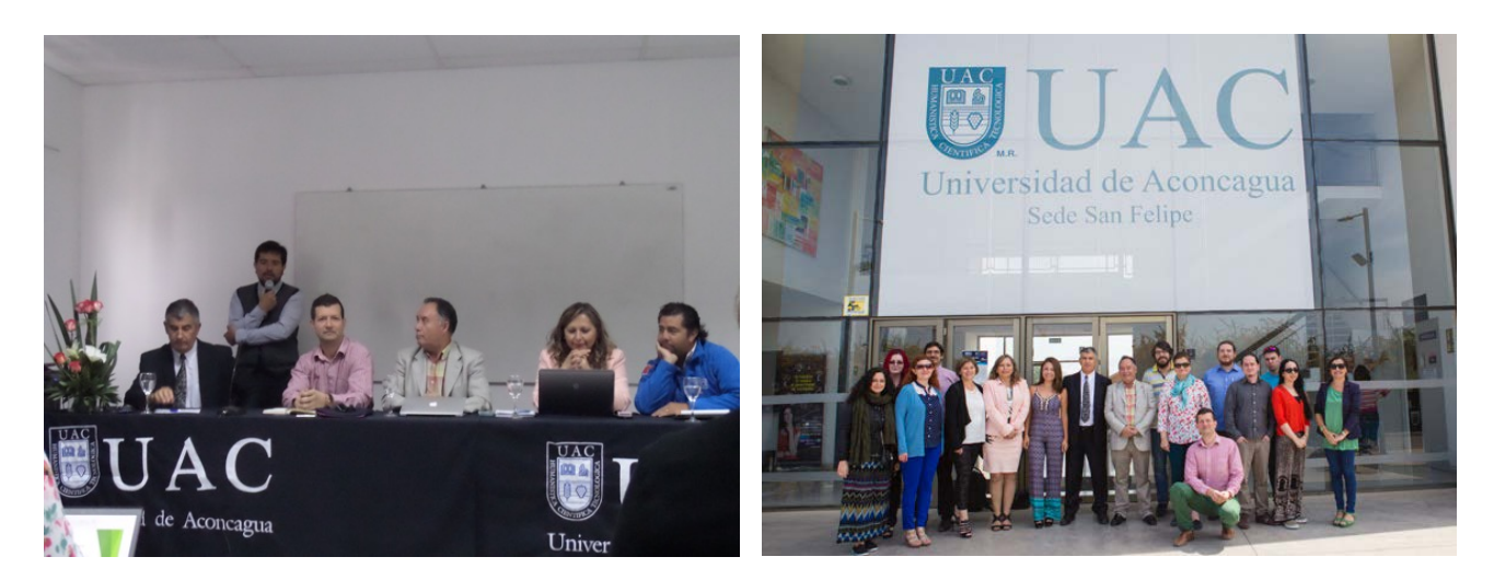
Presentations in San Felipe

During our stay in Chile, apart from the working sessions, our partners from Universidad de Aconcagua facilitated official meetings with representatives of the local authorities and of the national agency, responsible for employment and training. At these meetings we presented the situation of youth unemployment in our countries, the employers' expectations, and the competences' deficits.